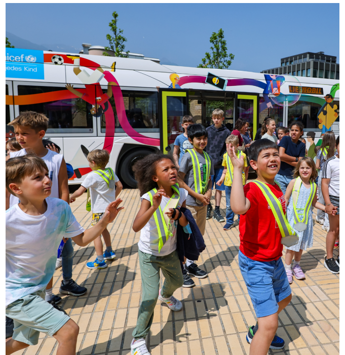
Liechtenstein: The «child rights bus» was officially unveiled on June 11, International Play Day. For a year, it traveled across the country, raising awareness of children's rights among both children and adults.

Companies can have an impact on children's rights by their actions throughout the entire value chain – directly, for example with regard to child labor, marketing practices or product safety. Or an indirect impact, for example through working conditions for parents or consequences for the environment. UNICEF works to ensure that children's rights are considered in the relevant regulations, and supports companies in dealing with risks and impacts of their activities on children's rights.